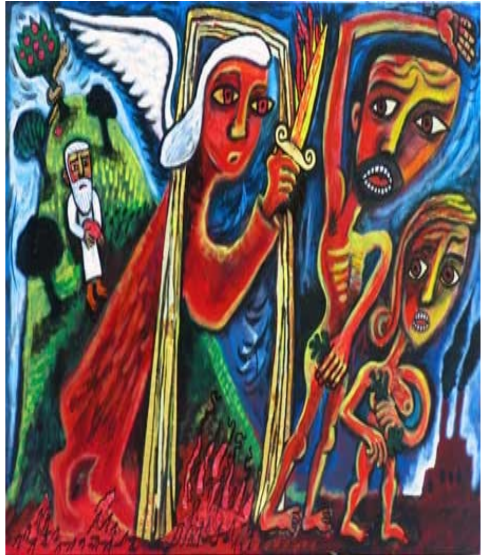
Whelan, Brian. "Paradise Lost". Digital Image of Painting. Quadrogiz. September 12, 2012. https://quadrogiz.blogspot.com/2012/09/mektoub-de-al-berto.html